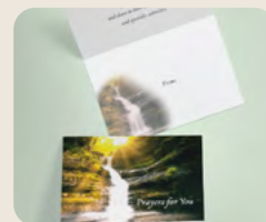
ALL OCCASION A