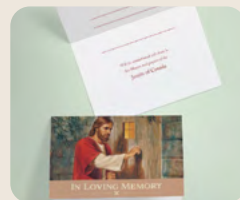
IN LOVING MEMORY A