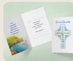
IN LOVING MEMORY B