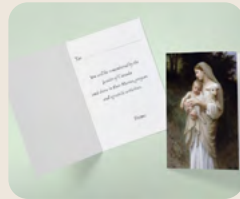
ALL OCCASION B